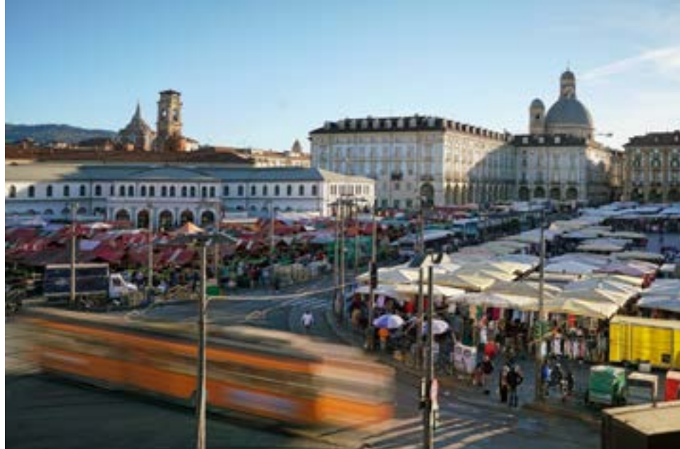
Porta Palazzo Market

The Gate , a local development agency part of the Urban Pilot Project started in 1996, became an operational tool of the City of Torino in 2002. It has been implementing new economic, physical and social development actions in Porta Palazzo neighbourhood. Over the years, it has supported projects to reduce housing degradation, redevelop urban areas with more efficient services, promote the historical heritage and business assets in that area, create new economic opportunities and trigger processes for the territorial promotion and development.