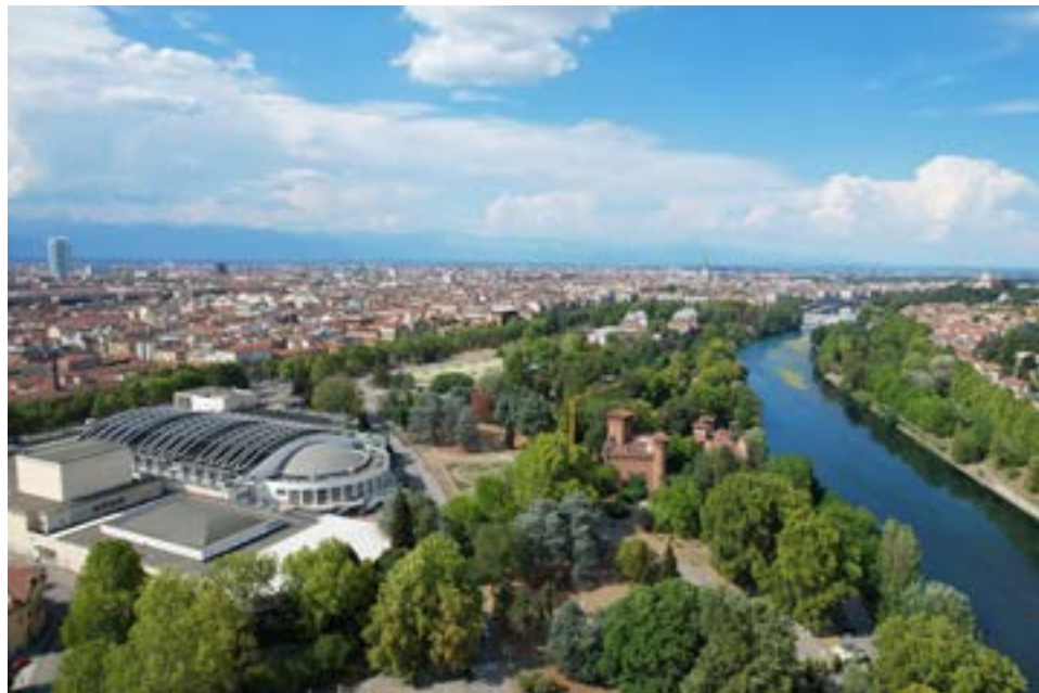
Valentino Park and Torino Esposizioni

Culture, accessibility, inclusion, participation – these are the key words of PIÙ , the Urban Integrated Plan of the City of Torino investing over 113 million euros of the National Recovery and Resilience Plan. PIÙ aims at dealing with urban regeneration starting from the city libraries as key elements of the urban social infrastructure . The plan envisages actions to be taken in 19 community libraries and the surrounding urban fabric, by focusing on material and social vulnerability, removing physical and socio-cultural barriers, improving the quality of public spaces and the places used for socialising and inclusion.