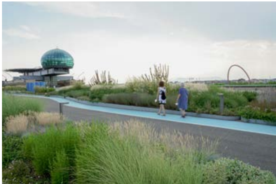
Lingotto, roof garden

Started in 2023 as part of Horizon Europe, the goal of this project is to test innovative approaches to urban planning which can lead the city to become climate neutral by 2050. Rather than using traditional methods, this project enhances the importance of data and implements innovative public procurement systems . Within this context, Torino has developed pilot actions for waste management and circular economy, by testing new types of services in a collaborative way.