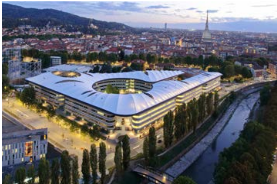
Campus Luigi Einaudi - Viale Mai

The ToNite project, funded by Urban Innovative Actions, deals with urban security and liveability - also at night - of the areas along river Dora. The project inclusive approach focuses on local communities and the territory potential, by considering security in terms of social innovation and urban regeneration . An example is the transformation of viale Mai into a new equipped pedestrian area of around 4,500 sqm. Thanks to an agreement between the City and the University of Torino, the physical actions have been integrated with some university services which are provided also at night time, to extend the use of the campus.