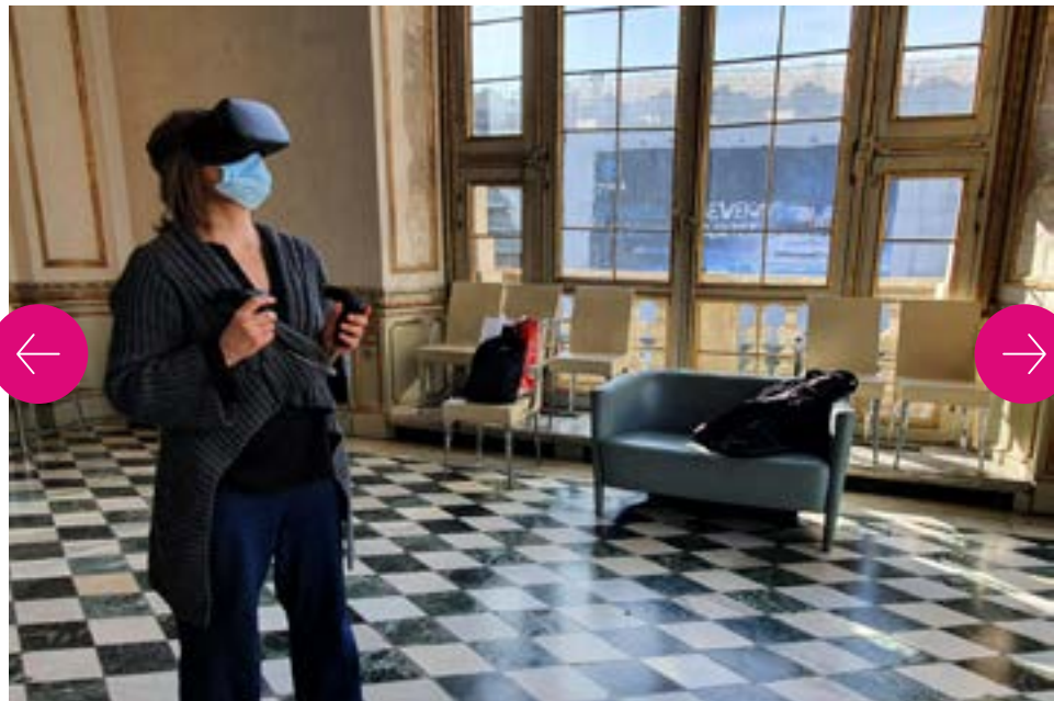
5GTOURS - Palazzo Madama

The project has demonstrated how the use of the 5G network can foster important innovations also in the healthcare-hospital and airport sectors , stressing the cross-sectoral application of this technology.