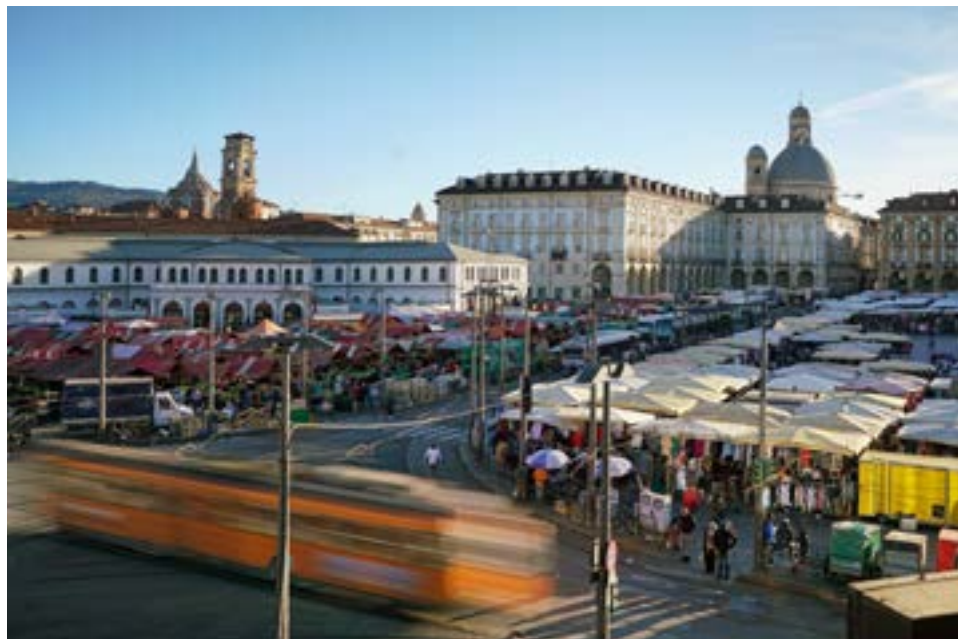
Porta Palazzo Market

The Gate , a local development agency part of the Urban Pilot Project started in 1996, became an operational tool of the City of Torino in 2002. It has been implementing new economic, physical and social development actions in Porta Palazzo neighbourhood. Over the years, it has supported projects to reduce housing degradation, redevelop urban areas with more efficient services, promote the historical heritage and business assets in that area, create new economic opportunities and trigger processes for the territorial promotion and development.