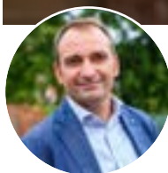
Stefano Lo Russo Mayor of Turin